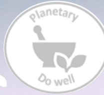
New Facial/Eye Care Launches with Niacinamide in Denmark

The art of Hygge: Enjoying life's simple pleasures