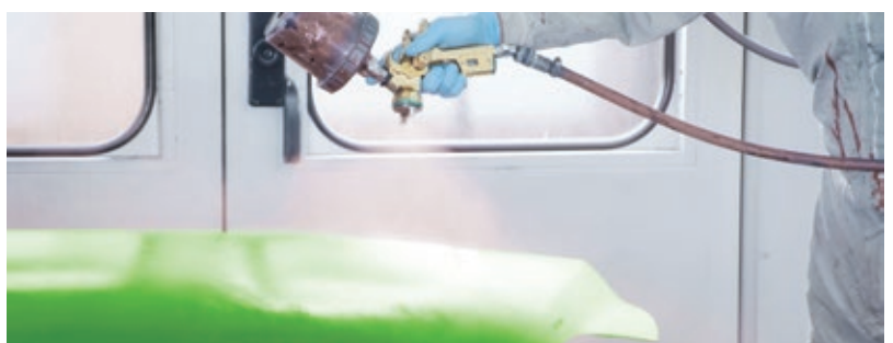
Automotive & Industrial Coatings